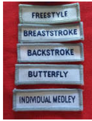
Flashes £1.50 each