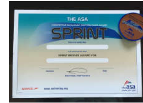
Performance Awards - £3.50 each