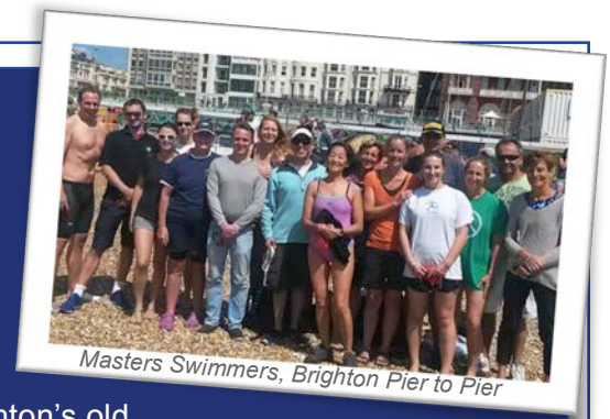
Masters Swimmers, Brighton Pier to Pier

Brighton Pier to Pier 18 July - Although the weather was warm, the sea was extremely choppy due to some strange weather patterns on the coast. This made the 1km swim from Brighton's old pier to new pier yet another great challenge for 15 CSCSC Masters.